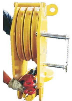
Quick Reeve Crane Block